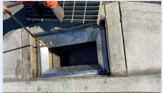
Final Product in Operation

This project represents a long-term investment in protecting local ecosystems and maintaining regulatory compliance.