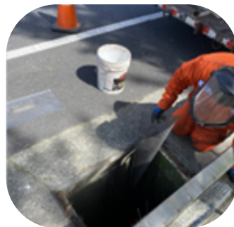
Installation at Storm Inlet